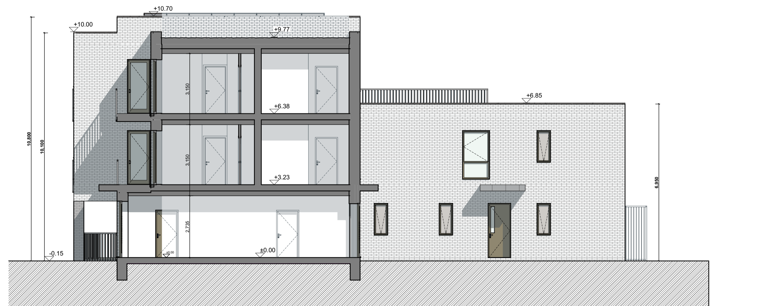
1:100 1 Section