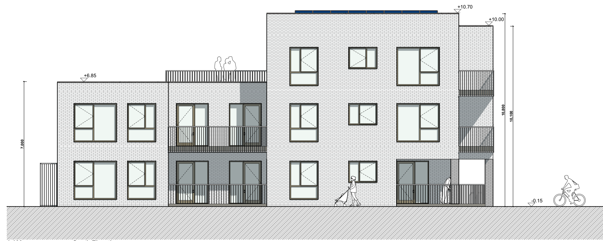
1:100 South Elevation