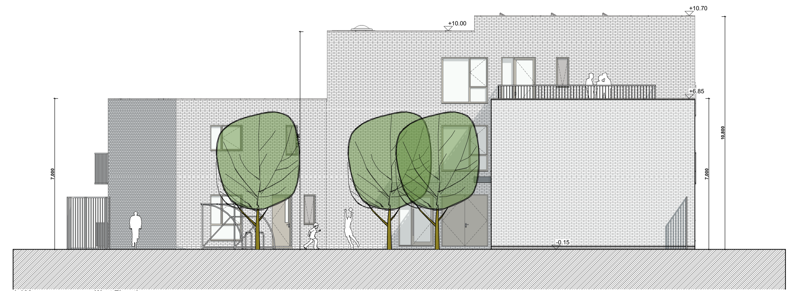
1:100 West Elevation