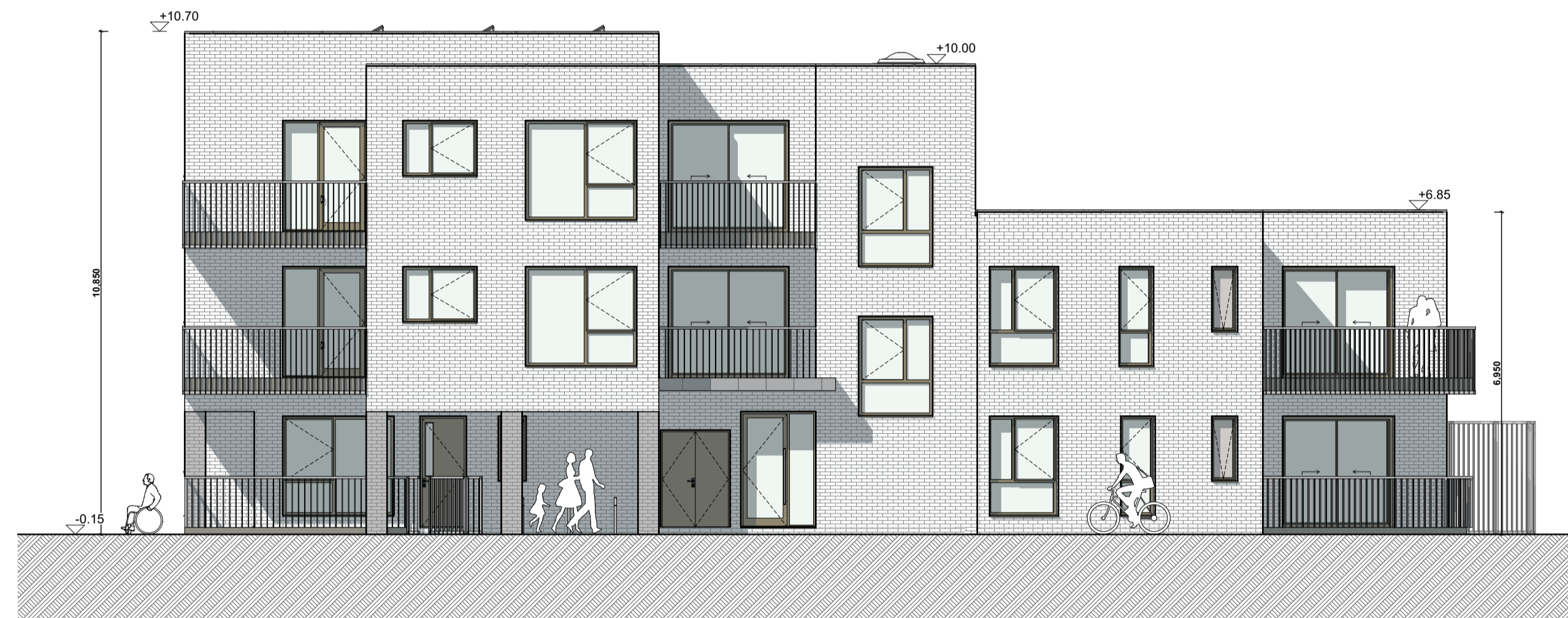
1:100 East Elevation